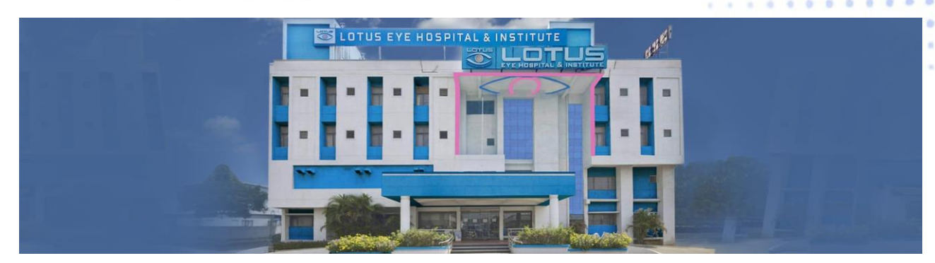
Corporate Office - 770/12, Avinashi Road, Civil Aerodrome Post, Coimbatore - 641 014